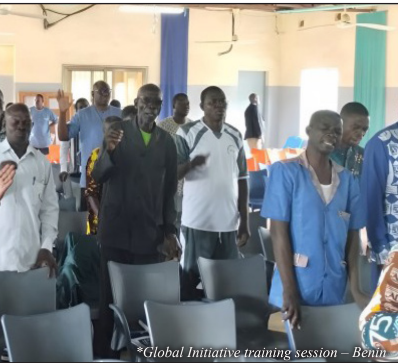
*Global Initiative training session – Benin